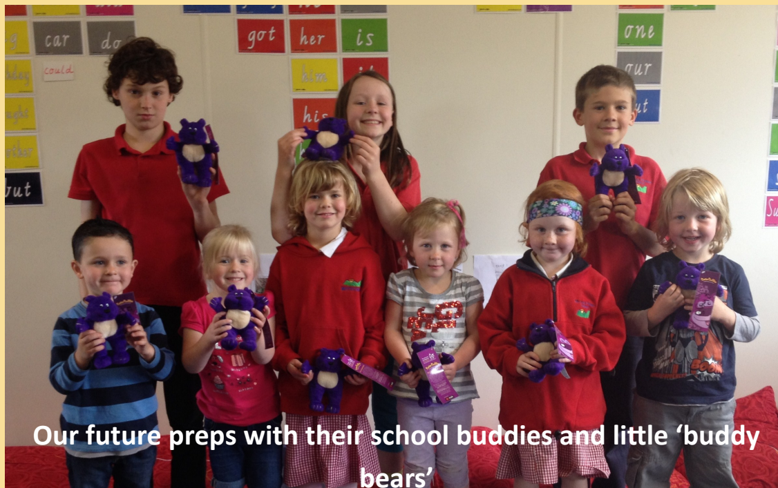
Our future preps with their school buddies and little 'buddy bears'