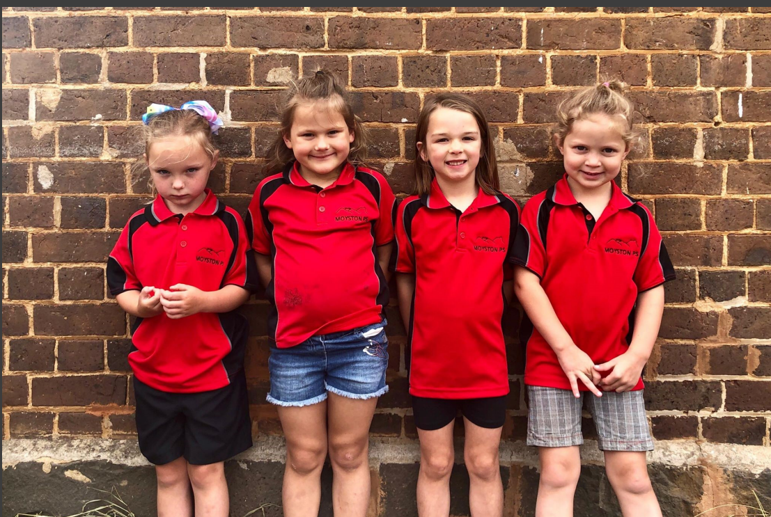
Grade Prep 2019