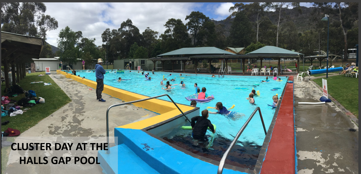
CLUSTER DAY AT THE HALLS GAP POOL

Permission forms have been sent home to families.