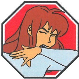
COVER MOUTH AND NOSE