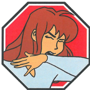
COVER MOUTH AND NOSE