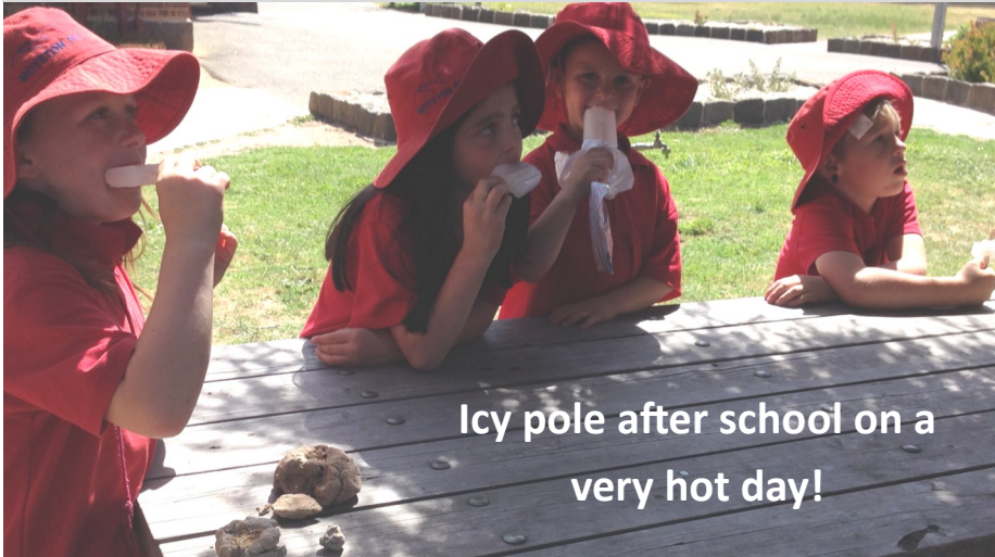
Icy pole after school on a very hot day!