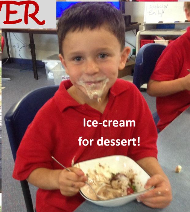
Ice-cream for dessert!