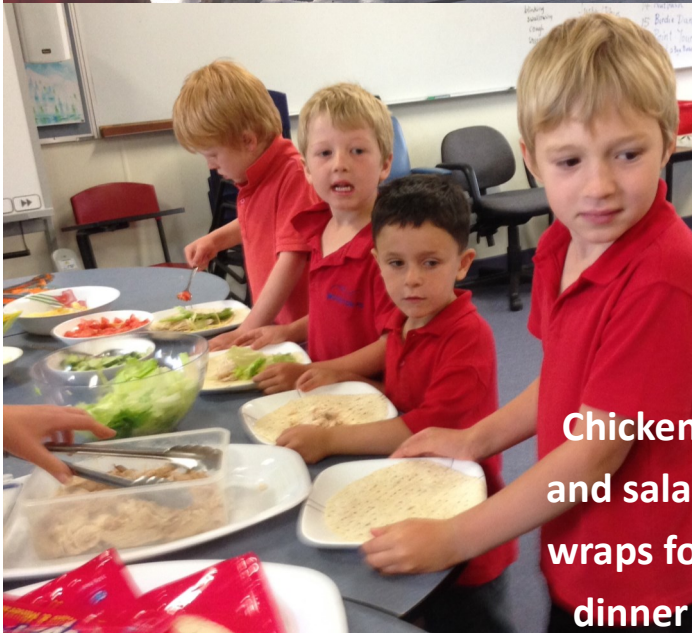
Chicken and salad wraps for dinner