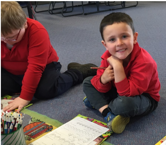
Prep, 1 & 2 students working hard in Maths this afternoon.