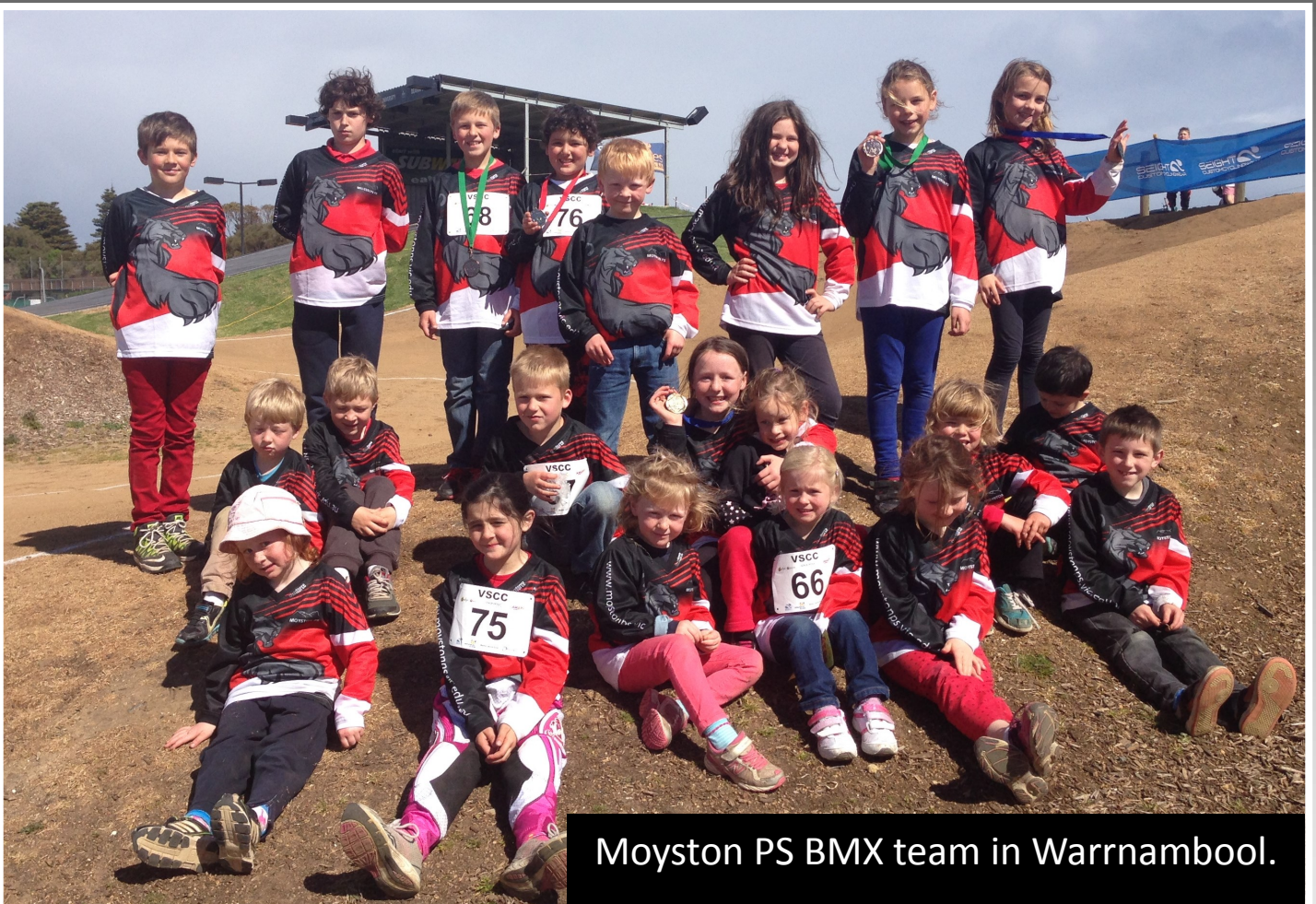
Moyston PS BMX team in Warrnambool.

Moyston Primary School aims to develop in our students a purpose of belonging and an understanding of the importance of taking responsibility for their own learning. This is to take place in a caring learning environment that engages students to work towards achieving their personal best in an atmosphere of mutual respect and cooperation, and assisting them to become valued members of the community.