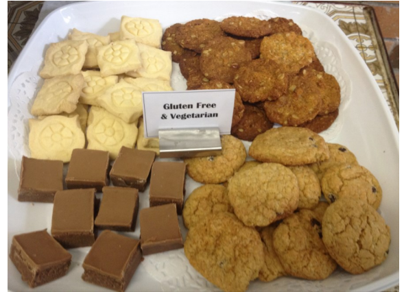
Some of the delicious food we served yesterday at Pomonal!