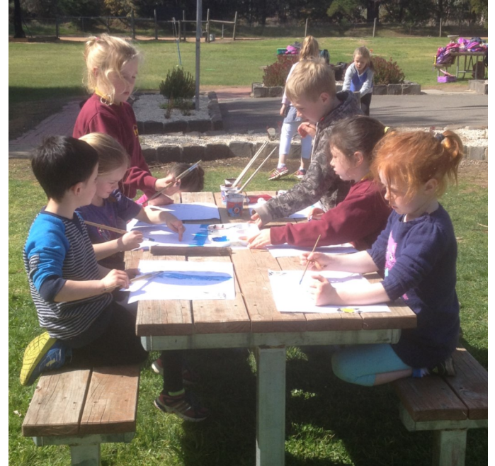
Dot painting and cricket this afternoon