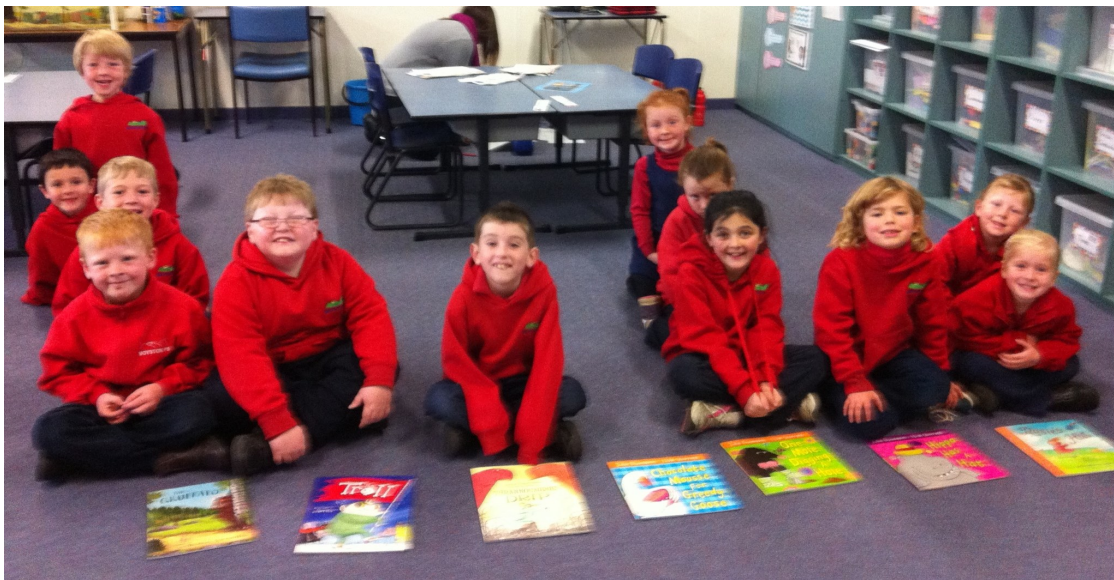
This week the Prep-Grade 2 students made a human graph of their favourite Julia Donaldson book.