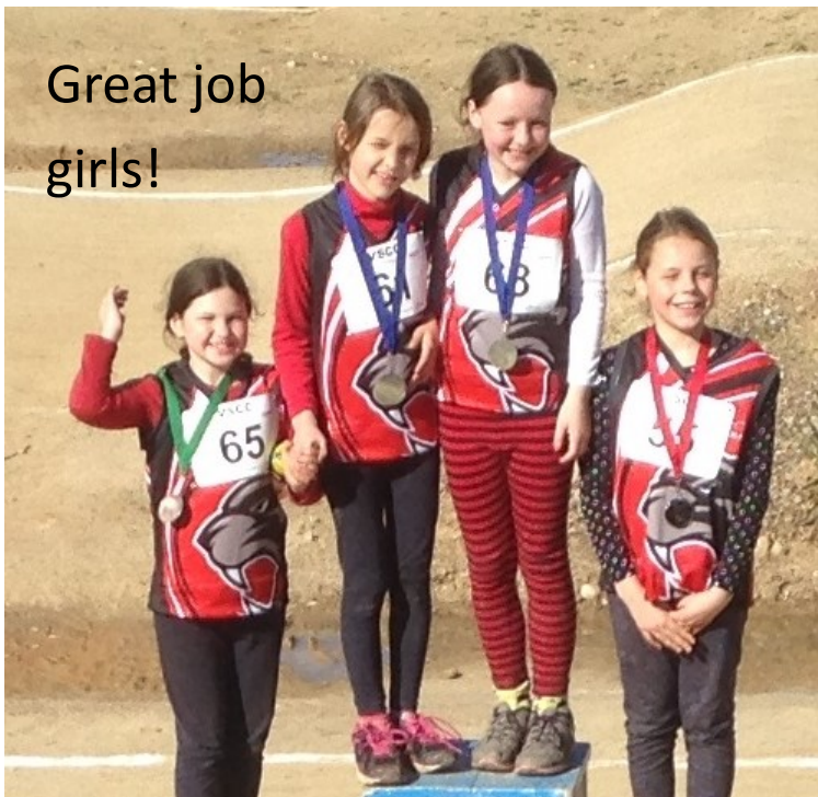
Great job girls!