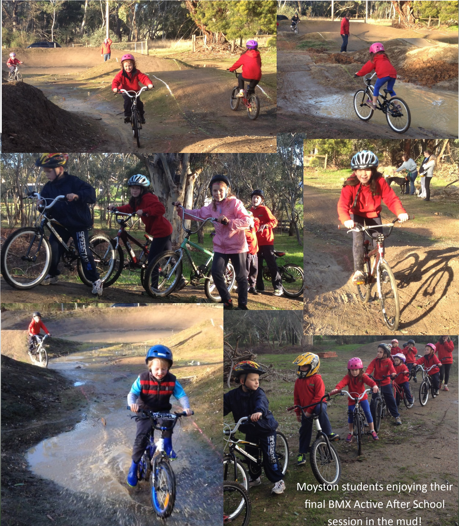
Moyston students enjoying their final BMX Active After School session in the mud!